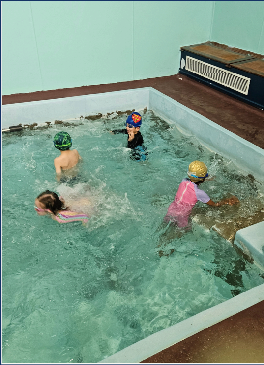
Small Pool for our junior students